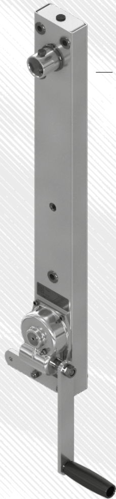
— HKG 06.50