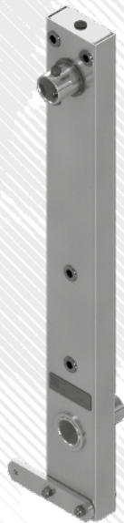
— HKG 06.51